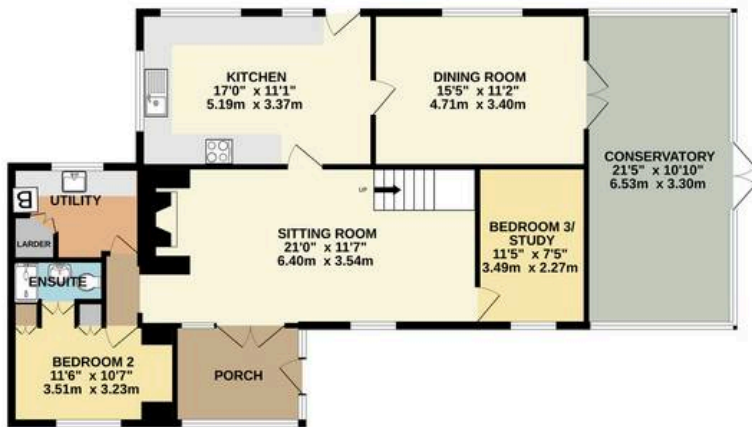
GROUND FLOOR 1204 sq.ft. (111.8 sq.m.) approx.