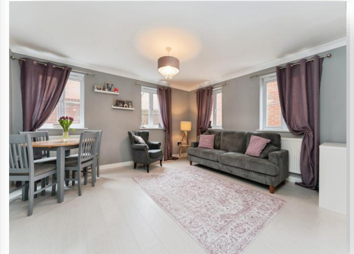
Parsons Lane, Littleport CB6 1JX