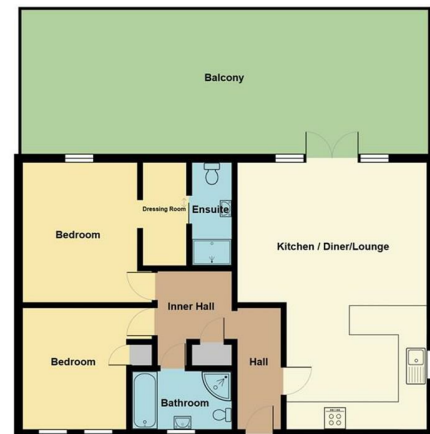
Apartment - Woodside View, 4, Hall Park Centre, Forest Drive, Lytham St Annes, FY8 4QF

Total Area: 80.0 m 2 ... 861 ft 2 (excluding balcony)