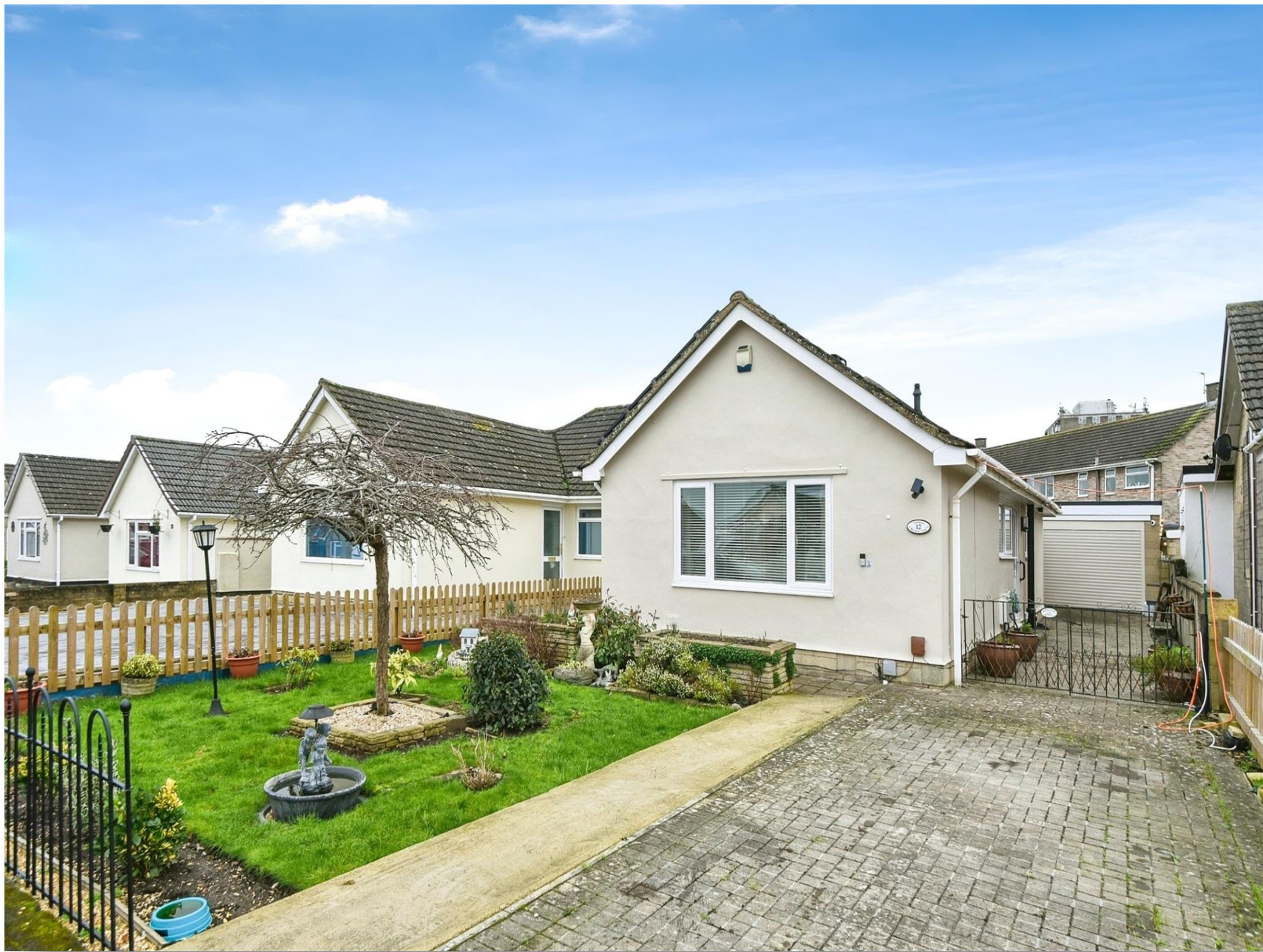
Barnard Close, Swindon SN3 3LZ