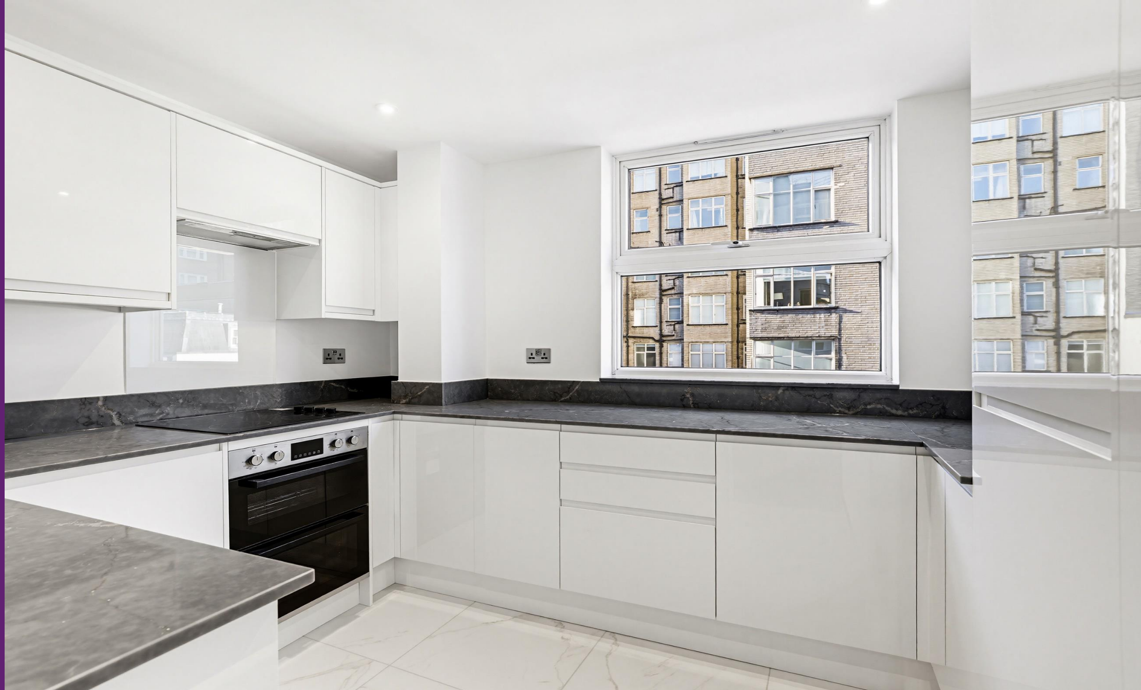
Whaddon House William Mews, SW1X