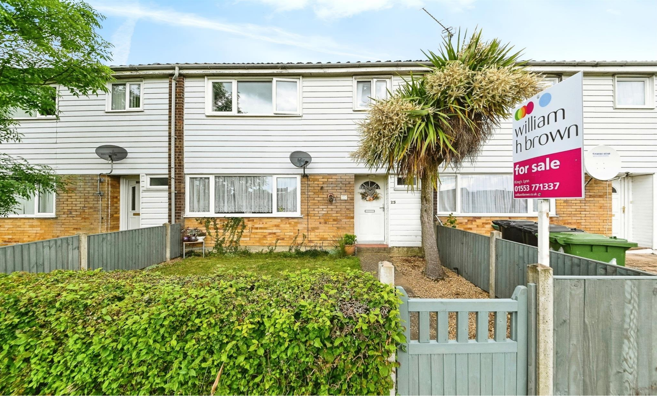
Silver Green, King's Lynn, PE30 4SG