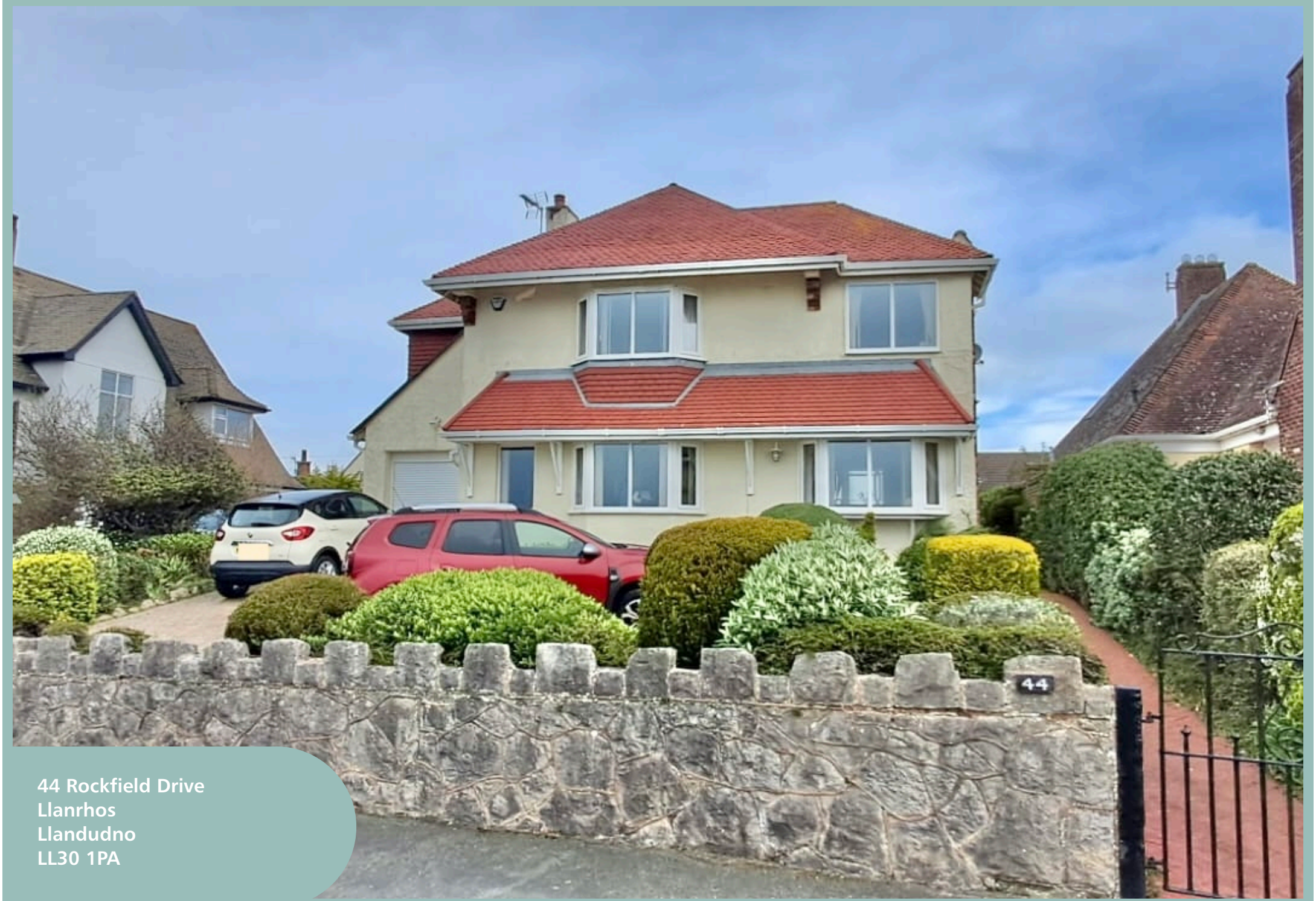
44 Rockfield Drive Llanrhos Llandudno LL30 1PA