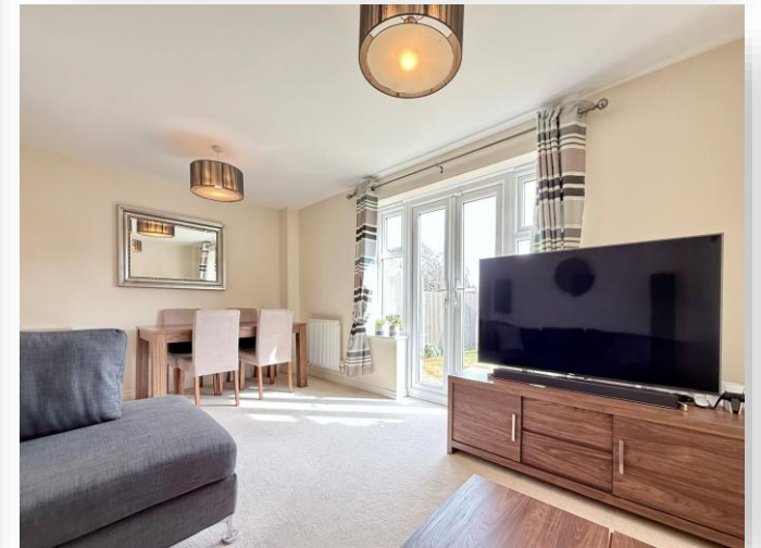
Wintergreen Road, Red Lodge IP28 8WU