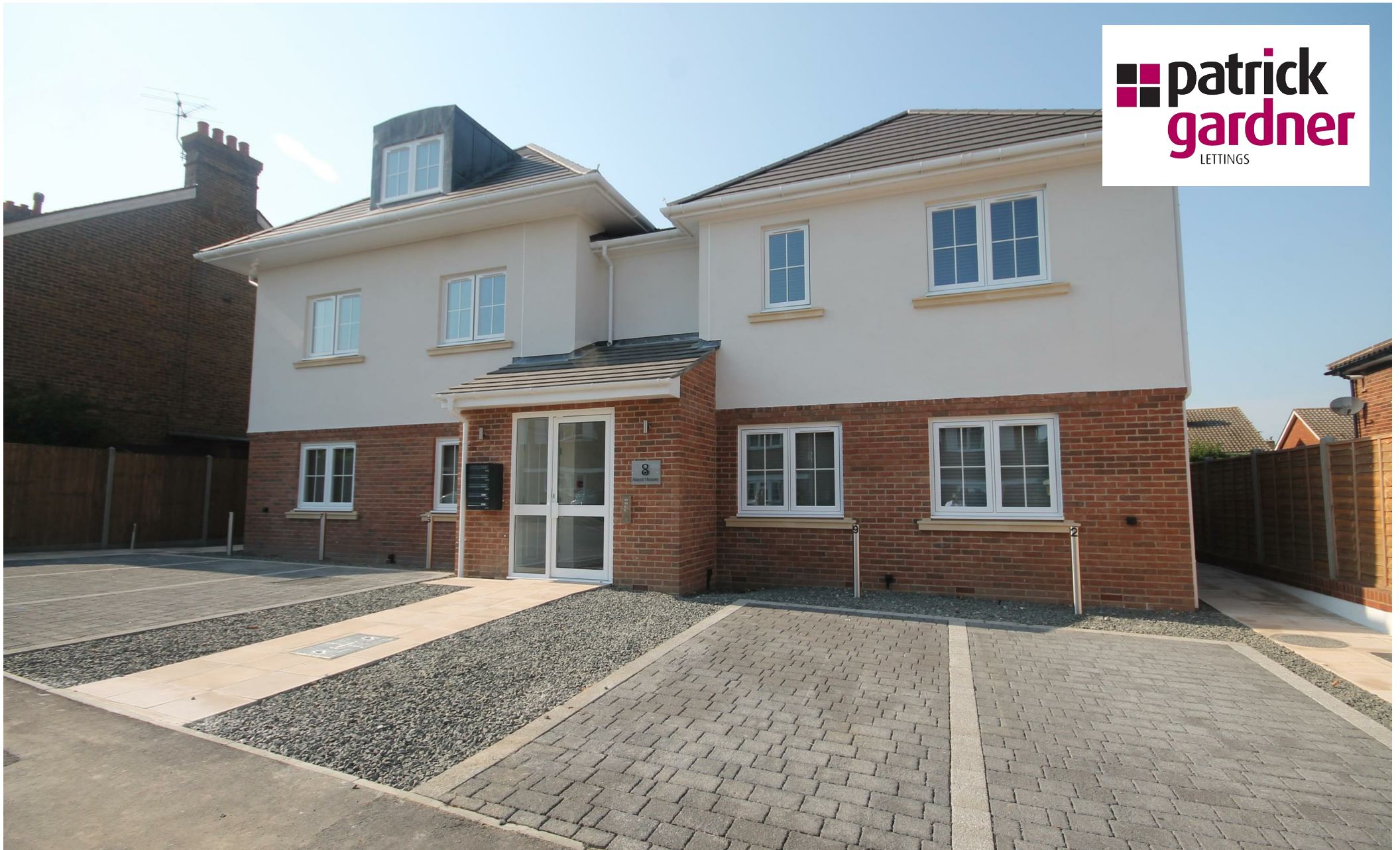
Andrews Close, Epsom, KT17 4EX