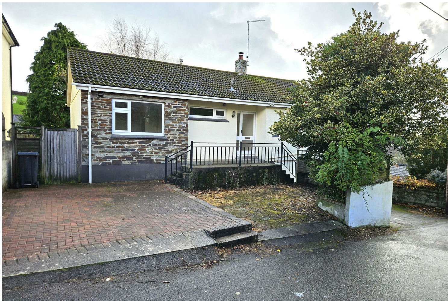
Cobble Barn Vicarage Lane, Tywardreath, Cornwall, PL24 2PF