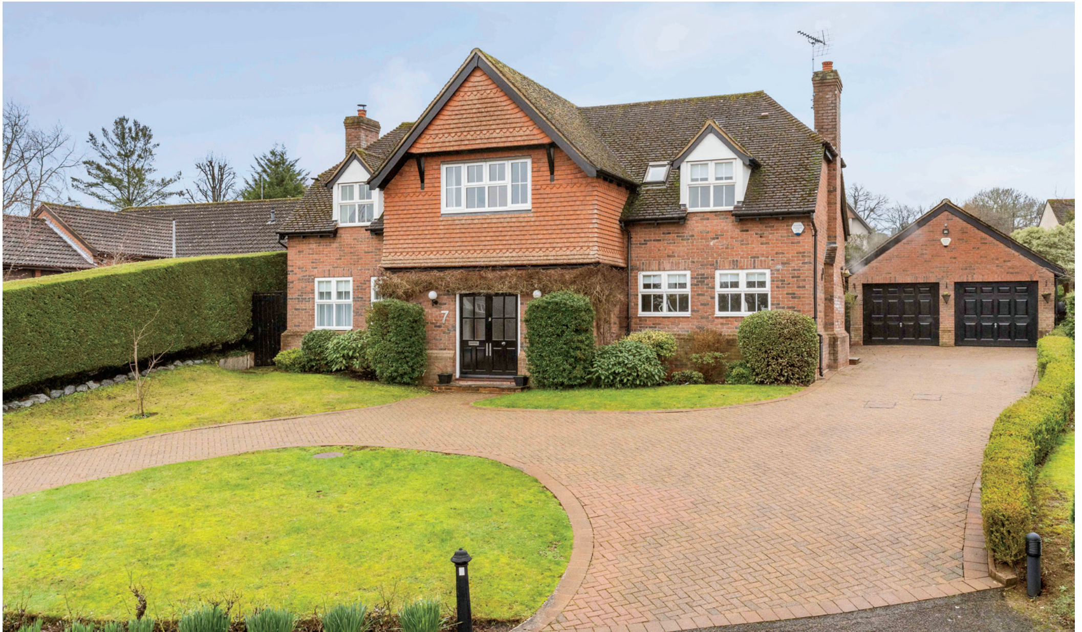
The Fold, High Pastures Little Baddow | Chelmsford | Essex | CM3 4TS