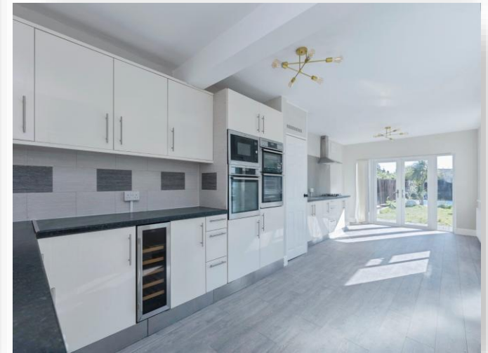
Loughborough Road, Birstall Leicester LE4 4NJ