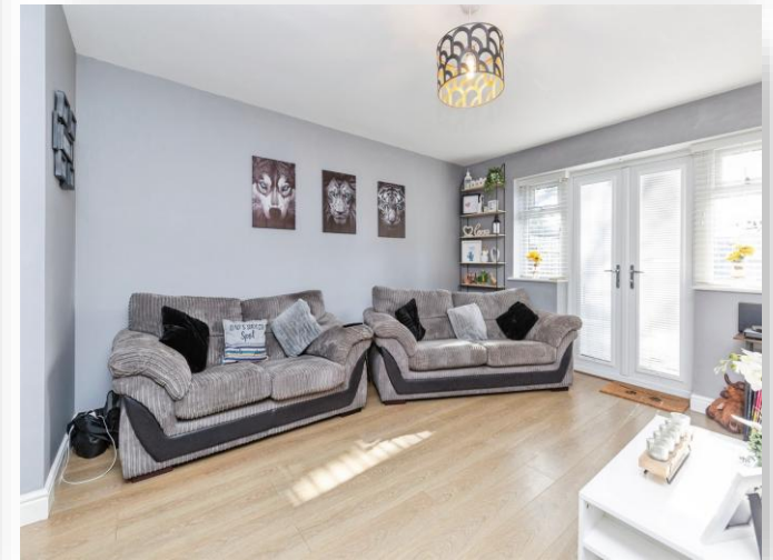
Blakelock Gardens, Hartlepool TS25 5QW