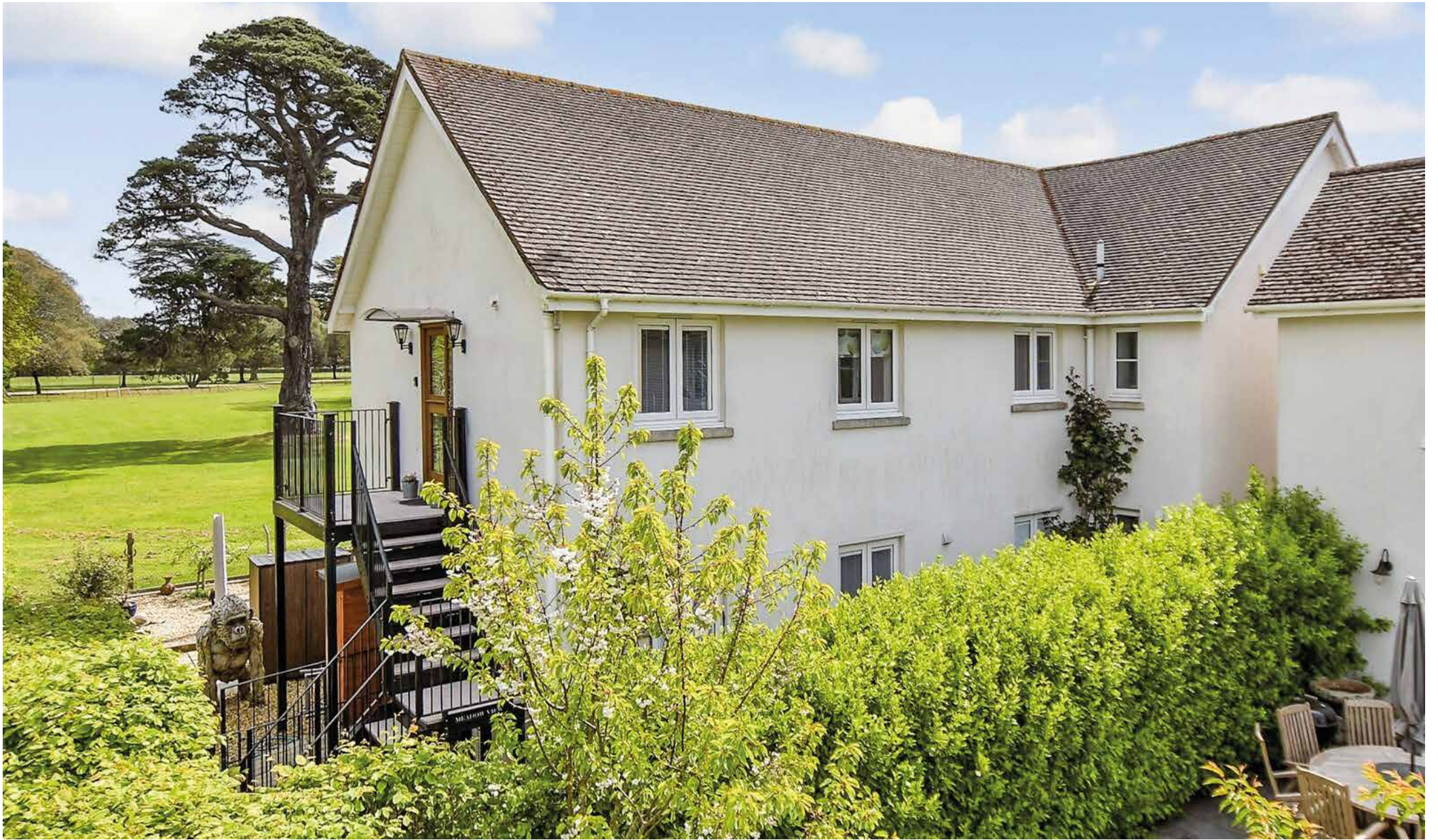
Meadow View Osborne Cottage | East Cowes | Isle of Wight | PO32 6BD