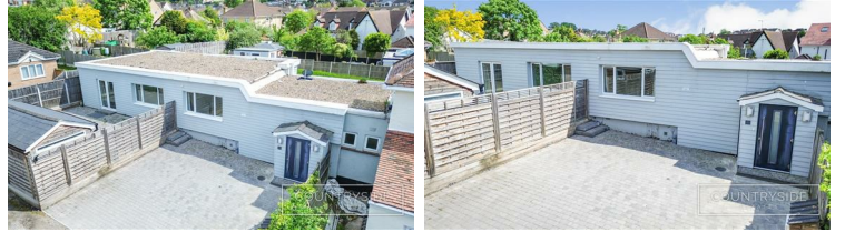
Blocked paved driveway with parking for two vehicles.