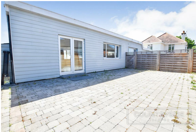
Shed 18'3" x 7'6" (5.56m x 2.29m)