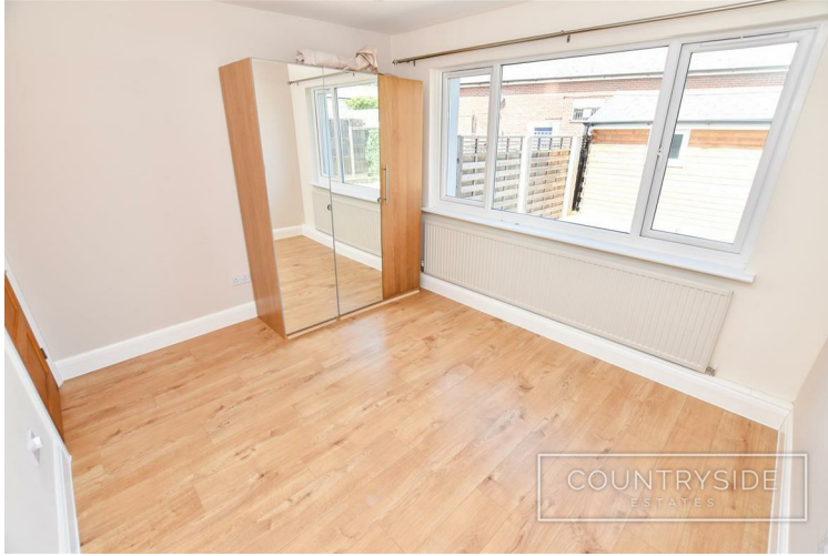
Window to front aspect, laminate flooring, smooth plastered ceiling, spotlights, radiator and power points.