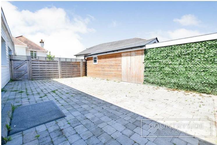
Low maintenance garden with external lighting and water tap.