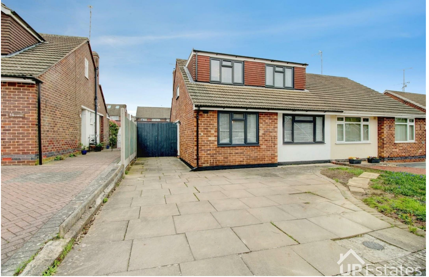
Cantlow Close, Coventry