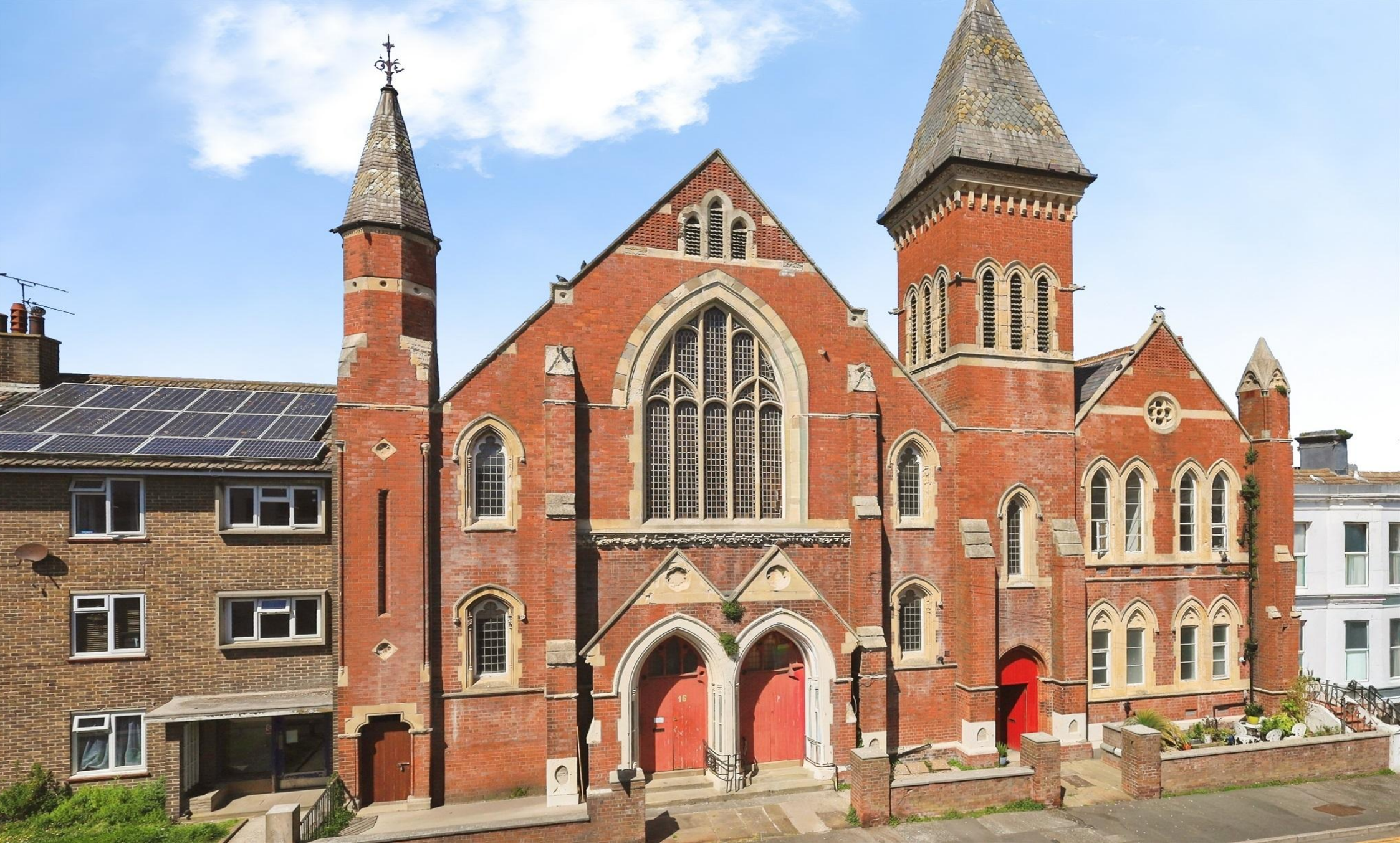
The Church Ceylon Place, Eastbourne BN21 3JF