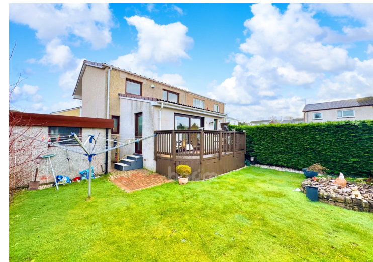
Lochy Place, Erskine