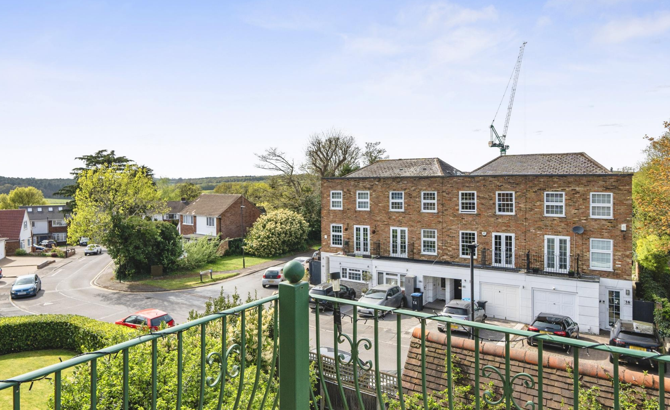
Holywell Lodge, The Ridgeway, Enfield, EN2 8JN