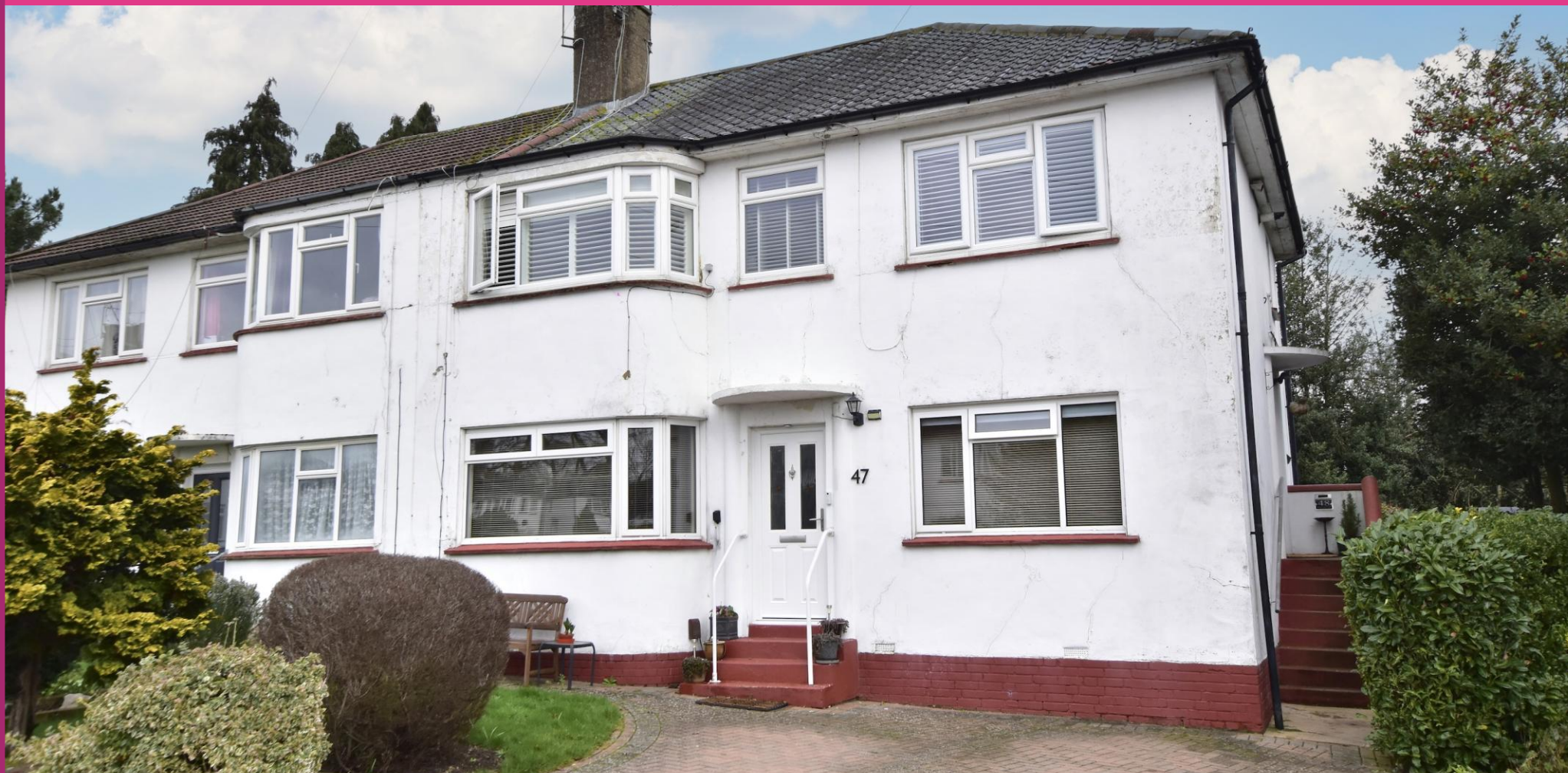
TREVELLANCE WAY, WATFORD - £290,000 2 Bedroom Maisonette