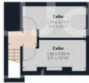
Floor -1 Building 1