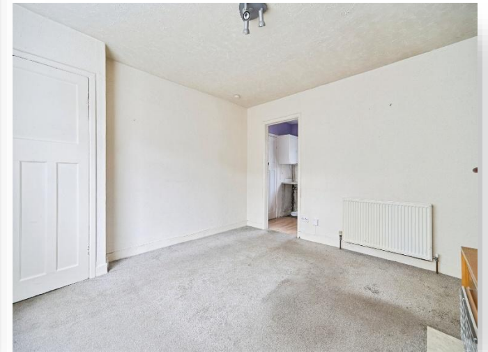
Prospect Grove, Shipley BD18 2LQ