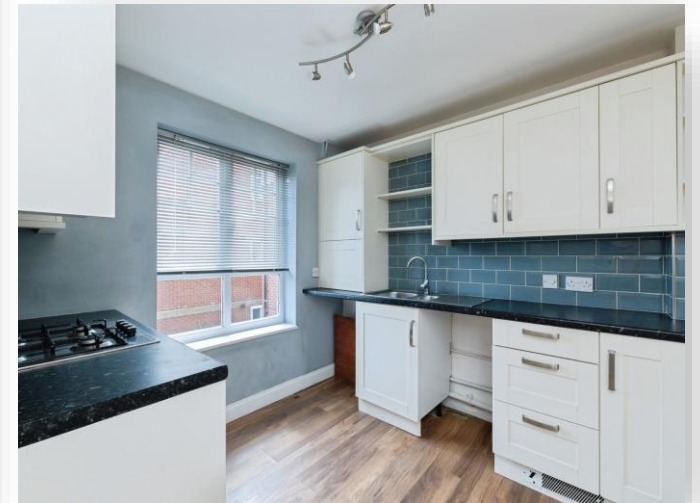
Wessex Gate, Bournemouth BH8 8PD