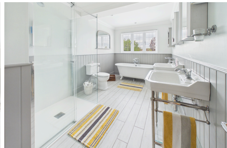
Property details: Mill Hill | Shoreham by Sea | BN43 5TH