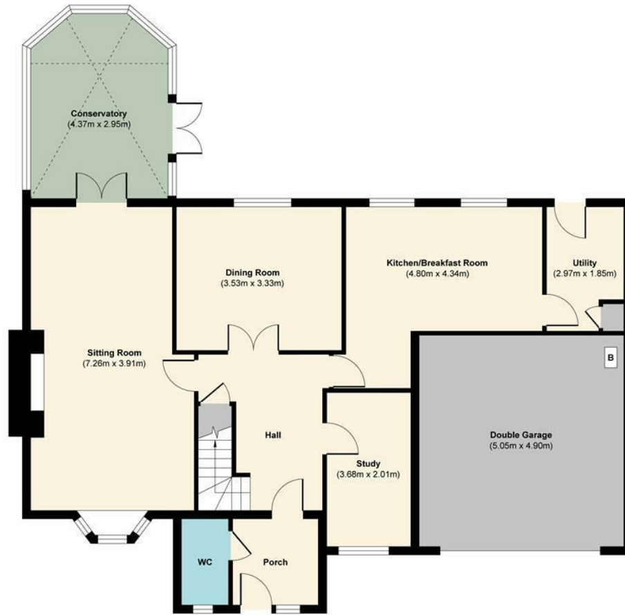
Ground Floor Approximate Floor Area (125.80 sq. m)