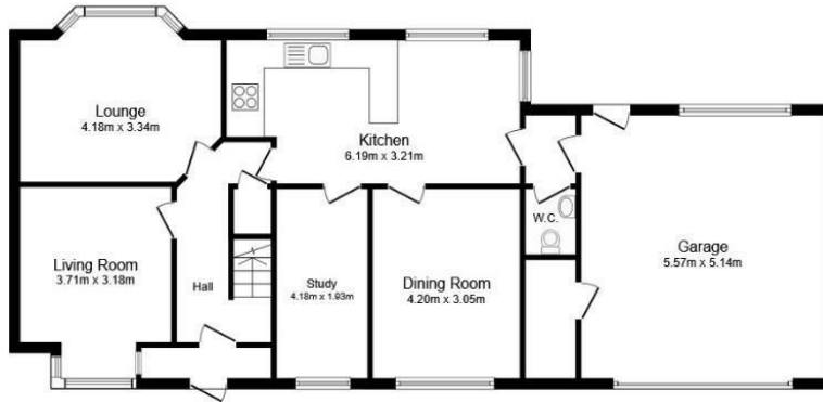
Ground Floor Floor area 111.5 sq.m.