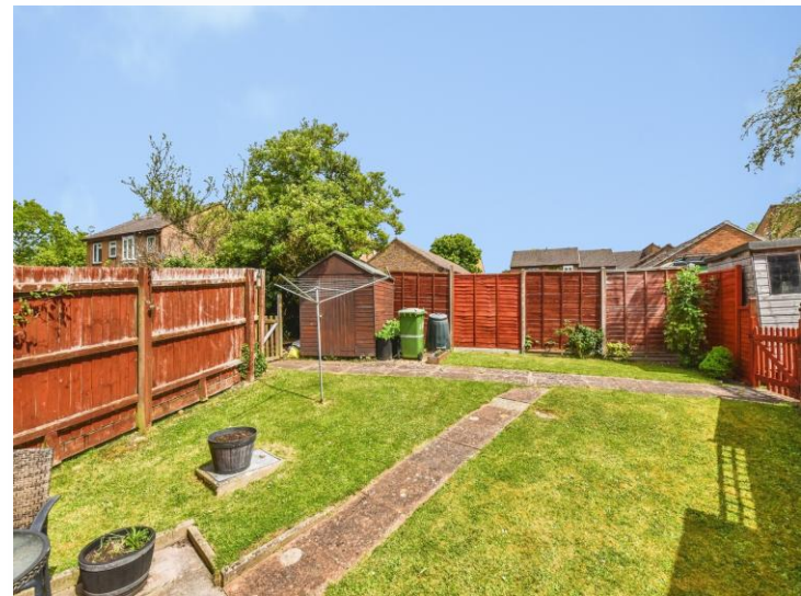
Beech Court, Frome, BA11 2TY