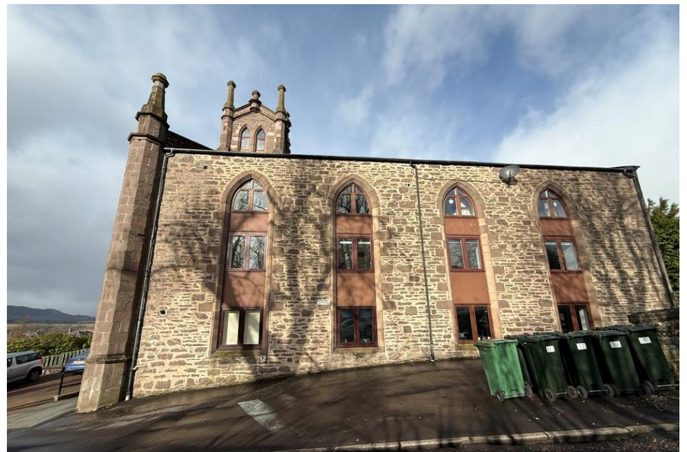
Next Home - 5 St.Ninians Court, Heathcote Road, Crieff, PH7 4AS