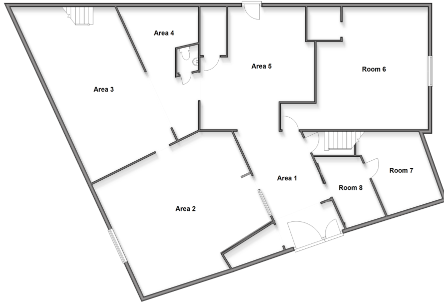
First Floor Approx. 146.9 sq. metres (1581.3 sq. feet)