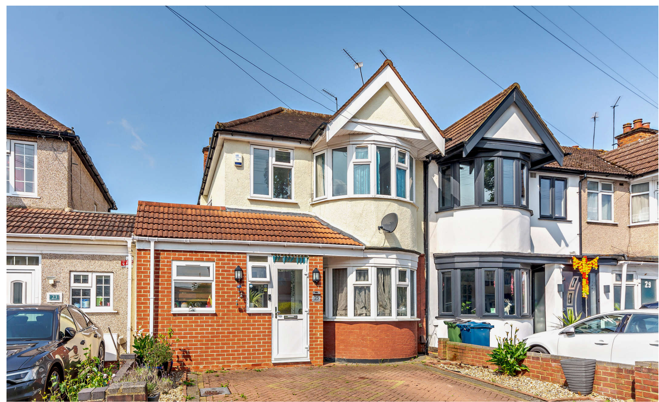
A four bedroom family home in a convenient location Ravenswood Crescent, Harrow, HA2 9JL