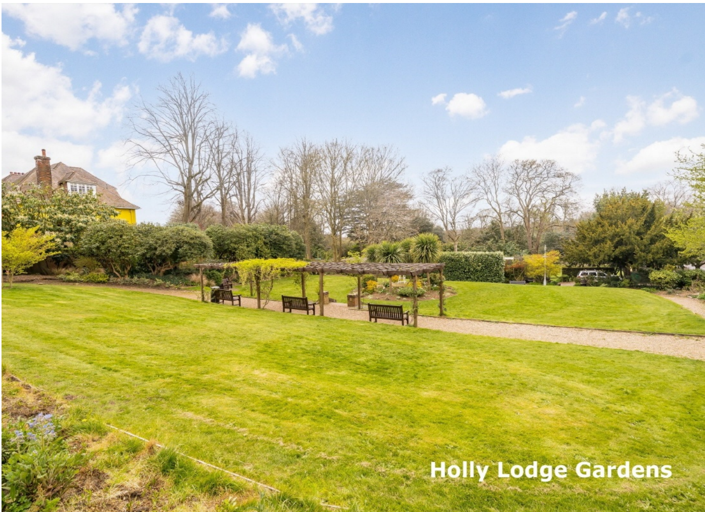
Holly Lodge Gardens