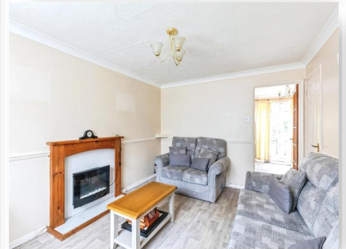
Sheffield Court, Raunds Wellingborough NN9 6RQ