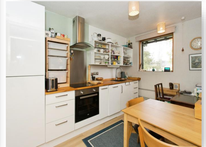
Ely Place Monkswell, Trumpington, Cambridge CB2 9SS