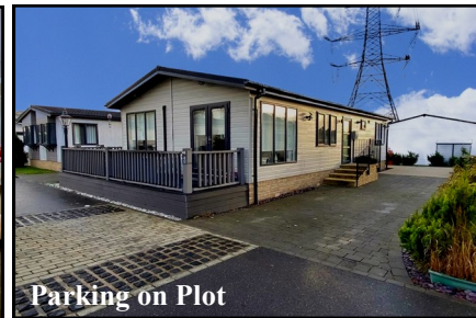
Parking on Plot

Pitch Fee: approx £333.45 per month including sewerage Subject to Annual Review Council Tax Band: 'B'