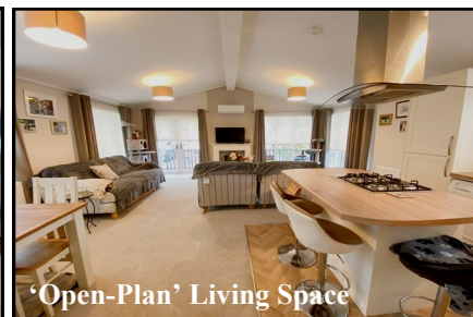
'Open-Plan' Living Space