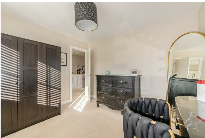
Bedroom Four 11'0 x 9'5 (3.35m x 2.87m )