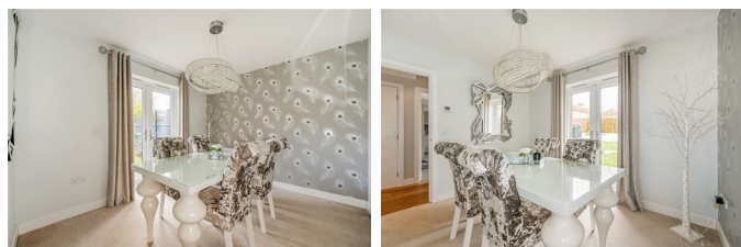
Dining Room 10'11 x 9'3 (3.33m x 2.82m)