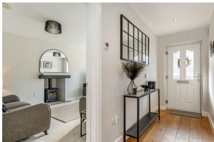
Living Room 18'1 into bay x 10'11 (5.51m into bay x 3.33m)