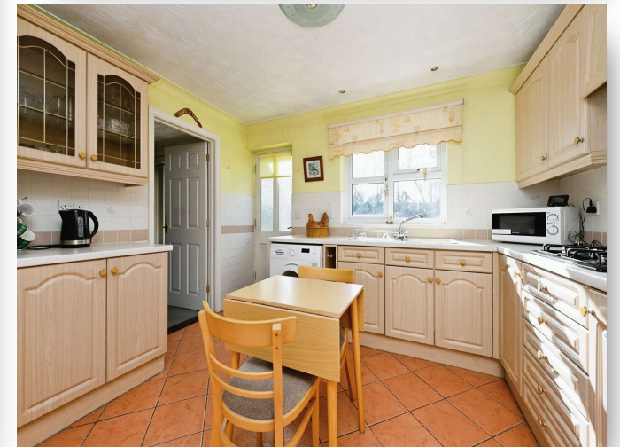
Greenwich Close, Downham Market, PE38 9TZ