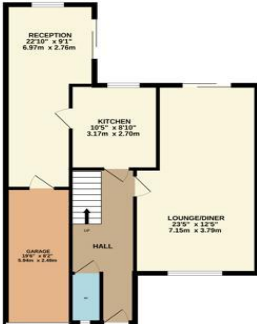
GROUND FLOOR 772 sq.ft. (71.7 sq.m.) approx.