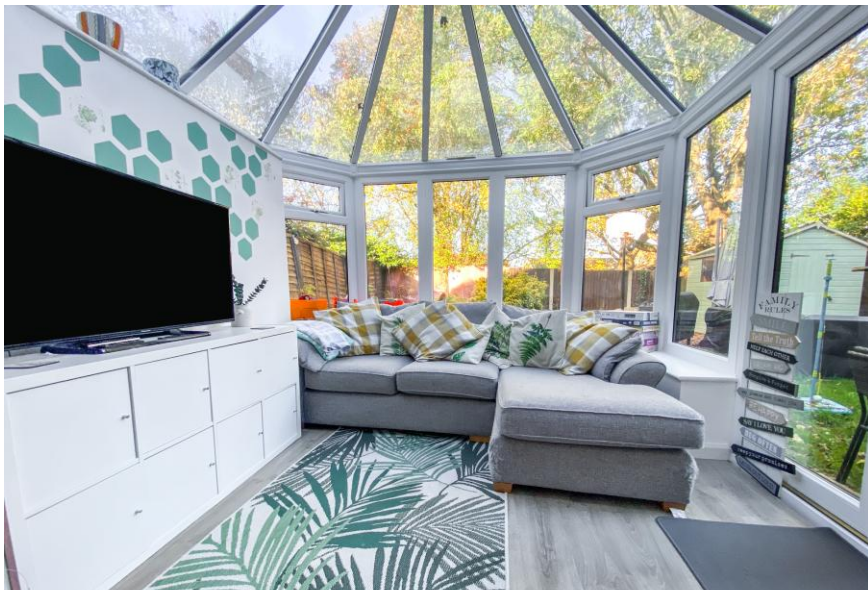
43 beattie rise