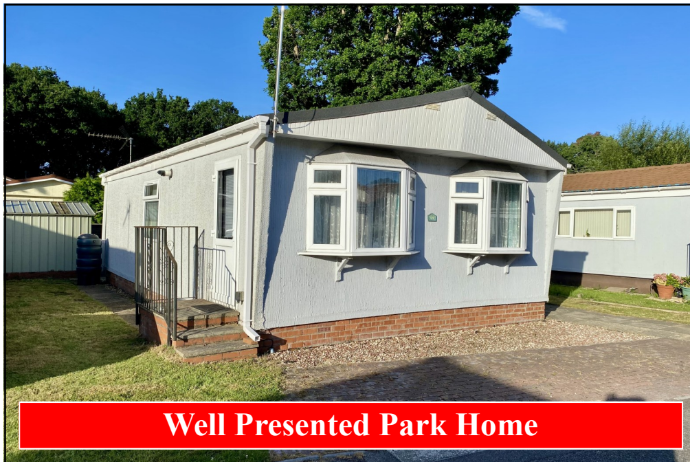
Well Presented Park Home

89 Gladelands Park, Ringwood Road, Ferndown, Dorset. BH22 9BW