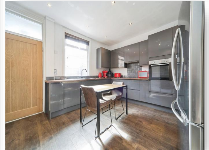
Low Lane, Horsforth Leeds LS18 5QL