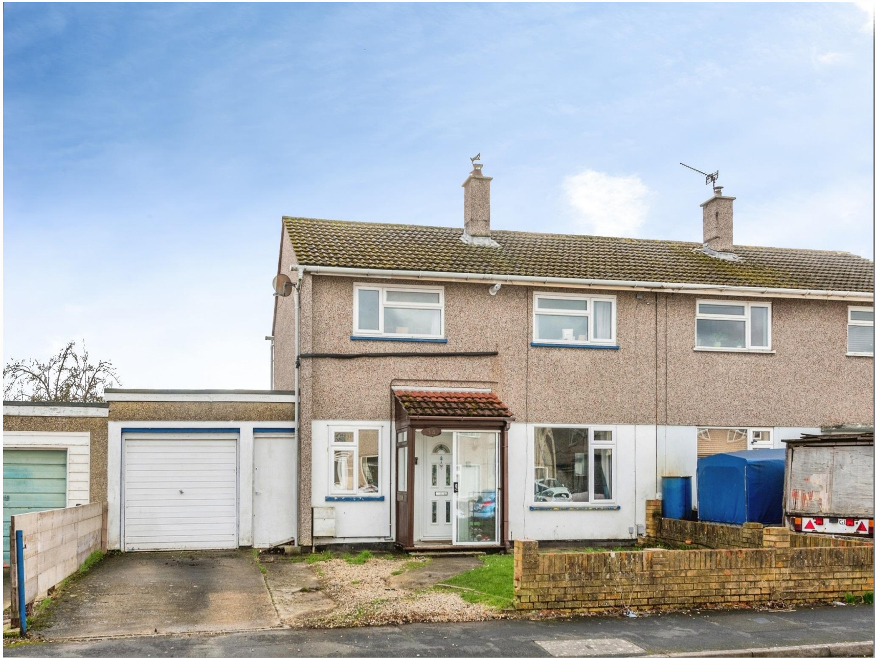
Midhurst Avenue, SWINDON, SN3 2QQ