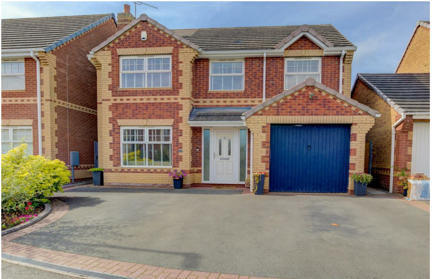
Cliveden Walk, Maple Park, Nuneaton