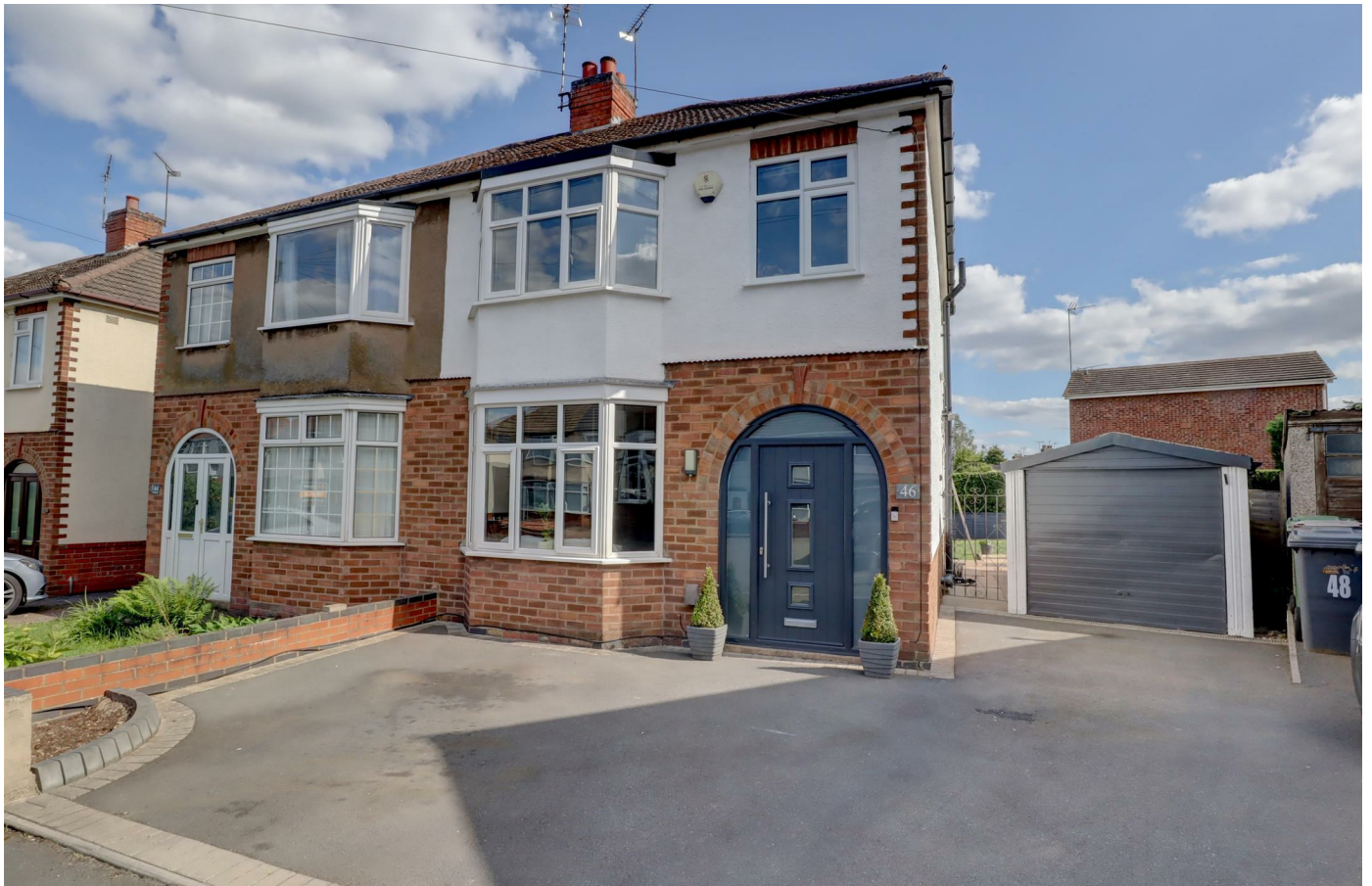
Oakdene Crescent, Weddington, Nuneaton