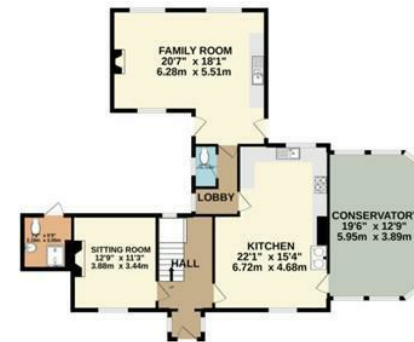
1ST FLOOR 595 sq. ft. (55.3 sq. m.) approx.