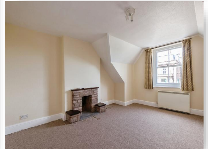
Ember Court, Glenmore Road, Minehead, TA24 5BQ