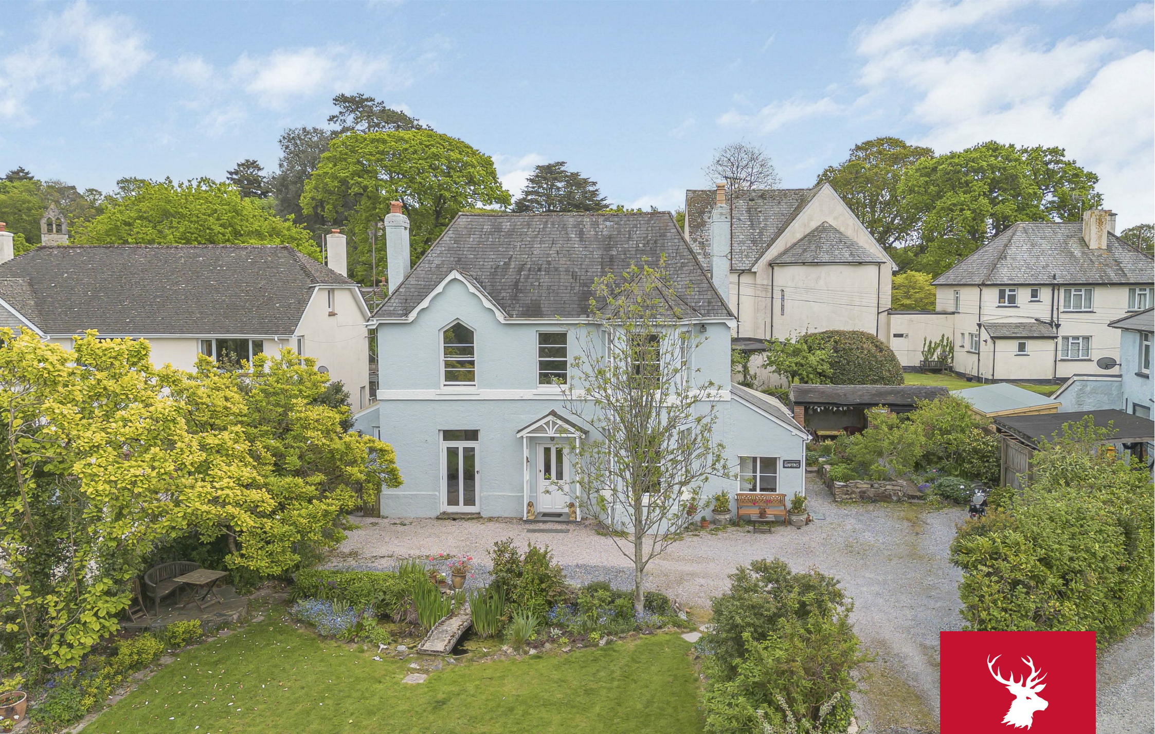
St Martins, Avenue Road