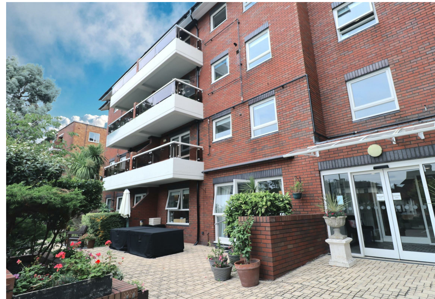
Finchley Road, London, NW11 7SB

This floor plan has been drawn in accordance with RICS Property Measurement 2nd edition. All measurements, including the floor area, are approximate and for illustrative purposes only. @fourwalls-group.com #66626