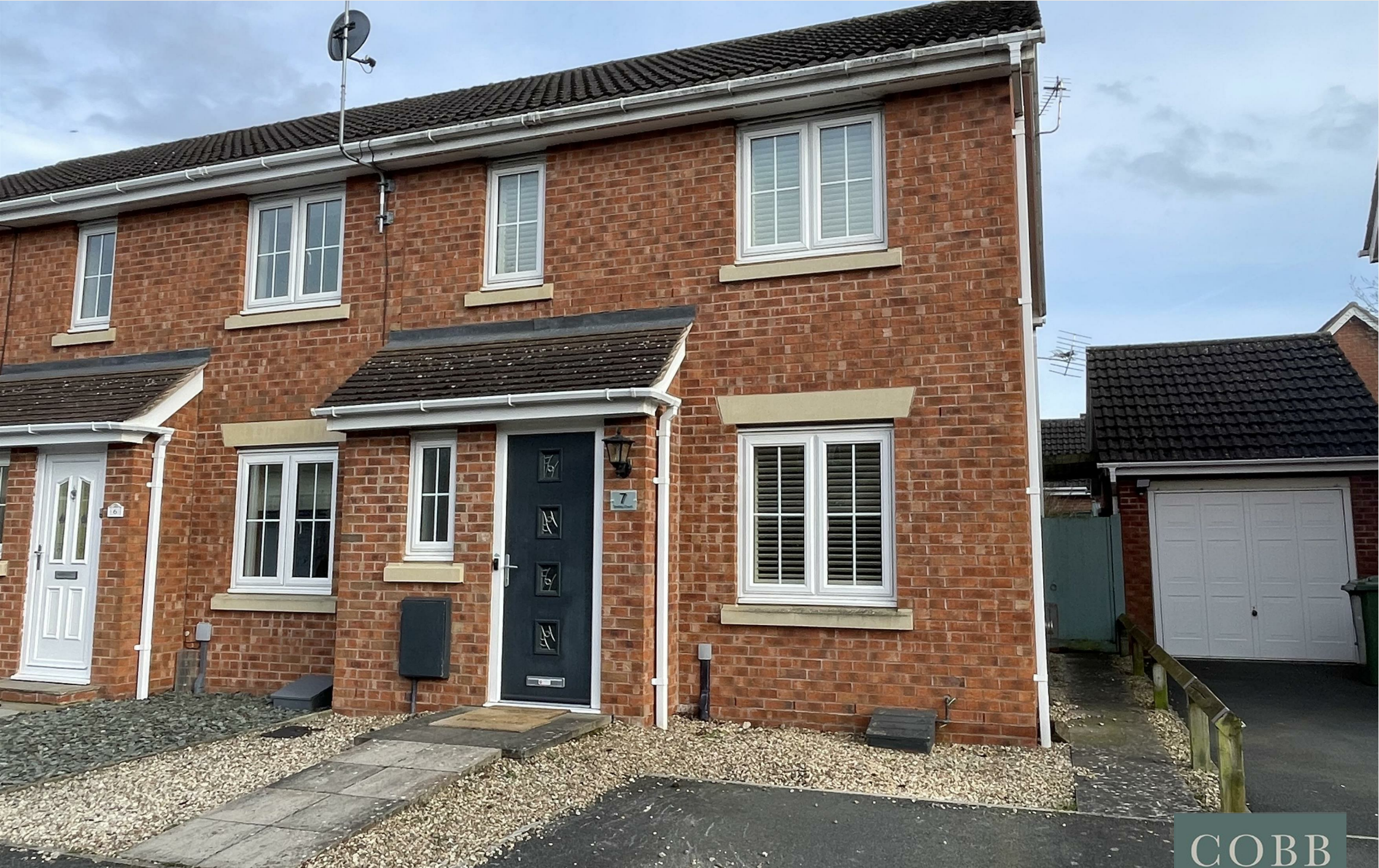
7, Smithy Court, Hereford, HR2 6RS Price £245,000