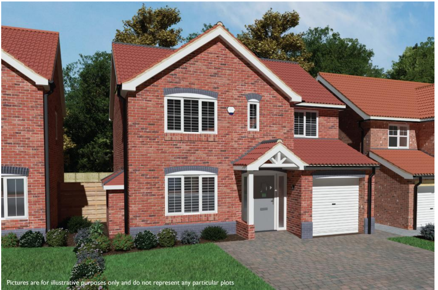
Pictures are for illustrative purposes only and do not represent any particular plots