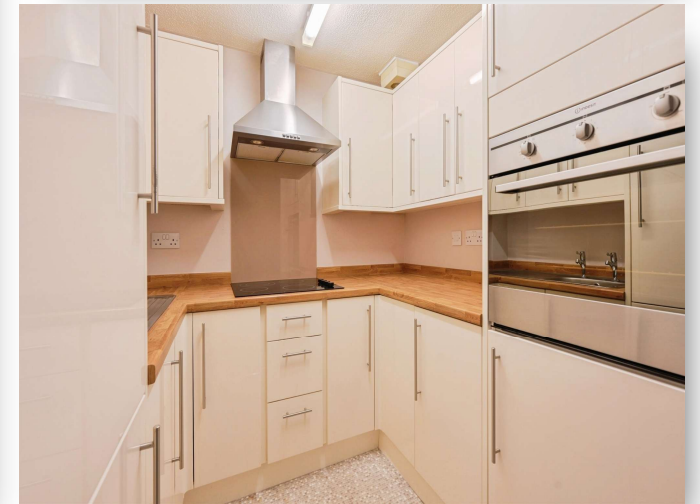
The Dovedales, Mickleover Derby DE3 0XL